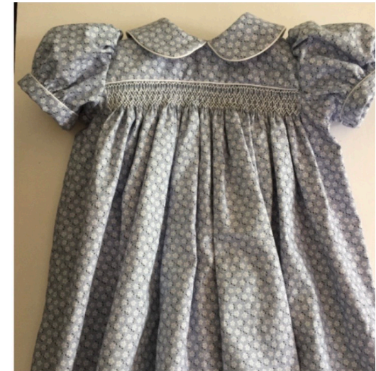
Sample Traditional Dress with Collar & Cuffs